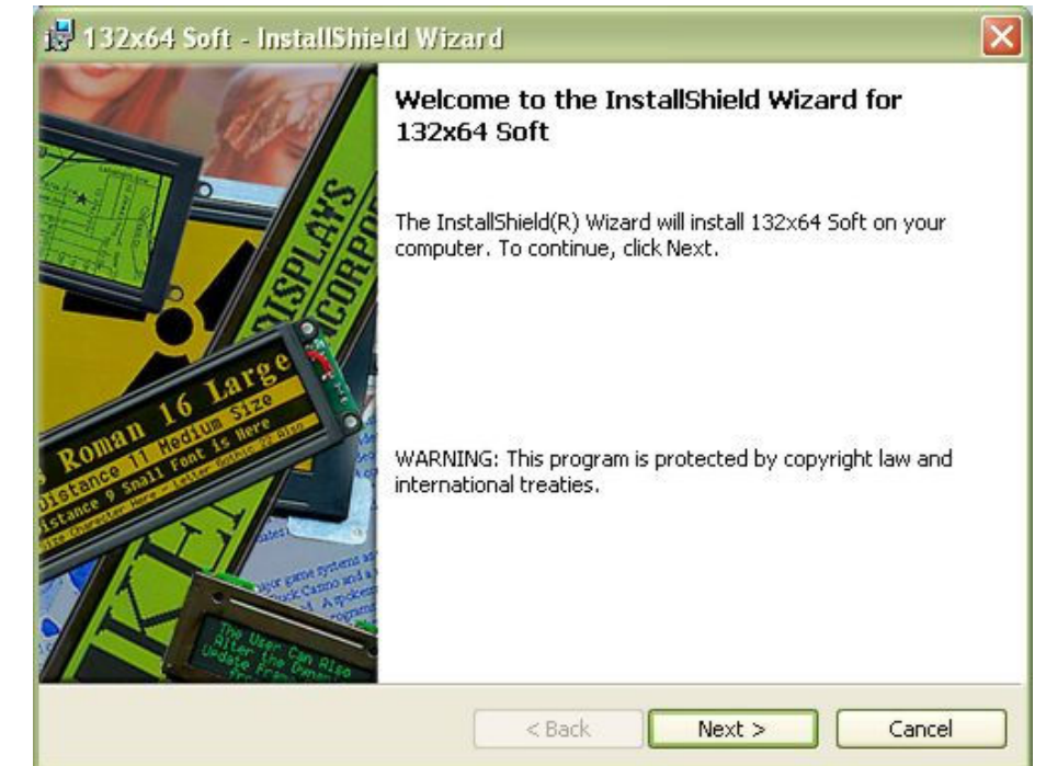
Figure 4 – 132x64 Soft – InstallShield Wizard

Load the software CD into the CD drive on your PC. If the CDROM auto-run application does not start, browse to the top-level directory on your CD drive and double-click the "go_kdi.exe" file.