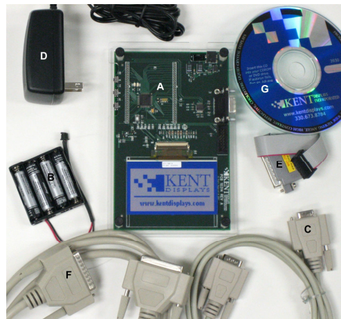
Figure 1 – Development Kit Contents