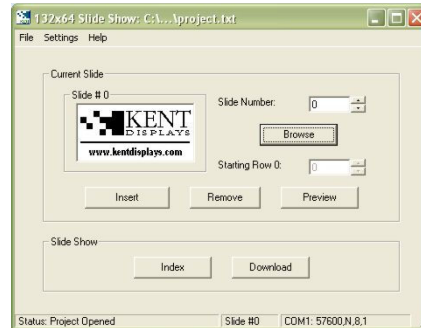
Figure 5 – 132x64 SlideShow Application Window

The "Index" button opens a new window to display the contents of all 12 image locations at once. The "Download" button sends all 12 images to the Development Kit Controller's flash memory at one time. Slide shows can be saved by using the "Save as Project" command on the "File" drop-down menu. Project files contain all image bitmap data (no link to the original bitmap files is maintained). Projects can be recalled via the "Open Project" command on the "File" drop-down menu.