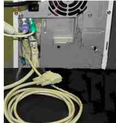
Figure 2 – PC Connection

Connect the RS232 cable to a PC serial port. A 9-pin serial port connection is required; install a serial port adapter card (not supplied), if the PC motherboard has no serial port available.